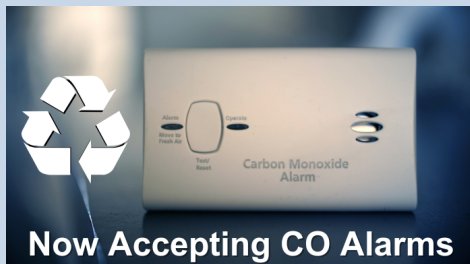
Now Accepting CO Alarms

Residents can recycle old alarms at the yellow bins in the Village Hall’s second-floor lobby or the River Forest Fire Station . This initiative promotes safety while supporting environmental sustainability.