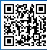
Scan the QR Code to Learn More

Volunteer to Serve on a Village Committee