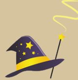
Willard Elementary School