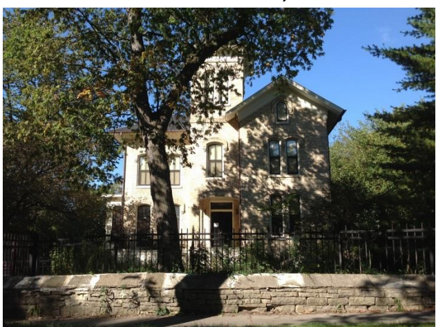
Abraham Hoffman House or Trailside Museum (1874)