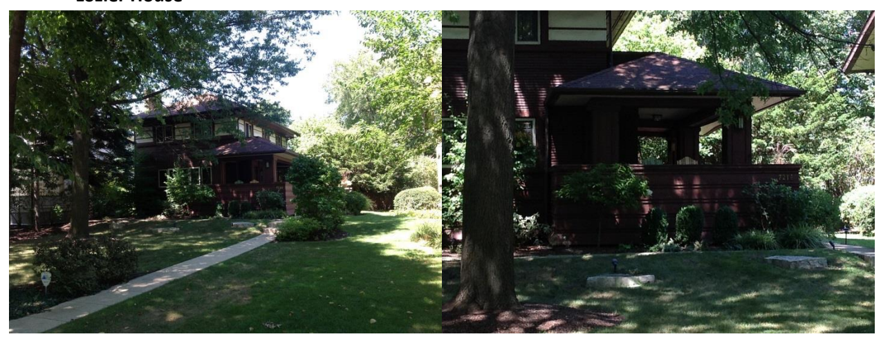
Lewis H. Lozier House (1906)