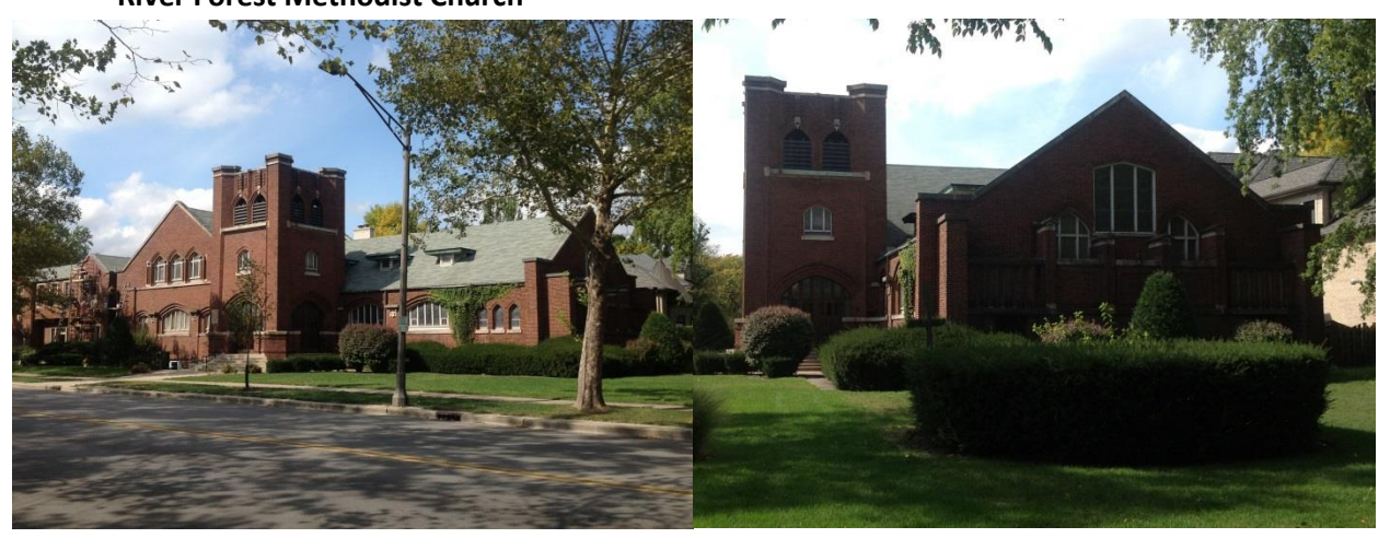
River Forest Methodist Church (1912)