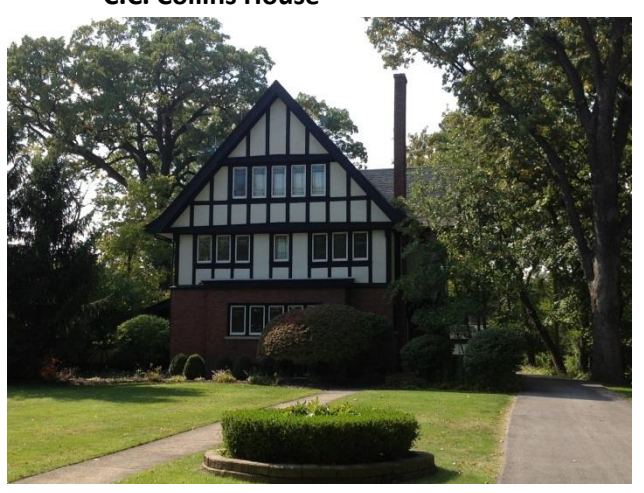
C.C. Collins House (1906)