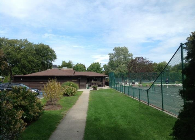
River Forest Tennis Club (1906)