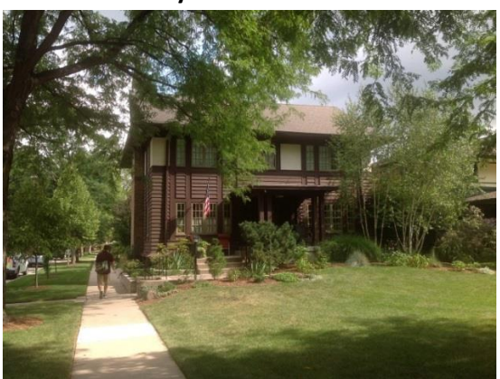
Elias Day House (1907)