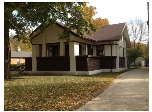
John Piggott House (1909)