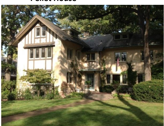
C.S. Pellet House (1915)