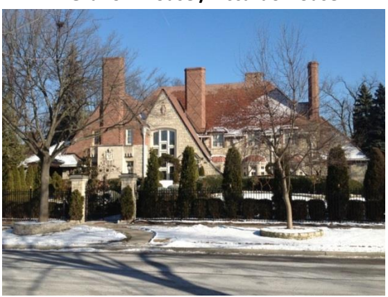
Grunow/Accardo House (1929)