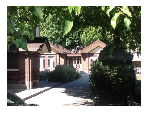
Charles Purcell House (1909)