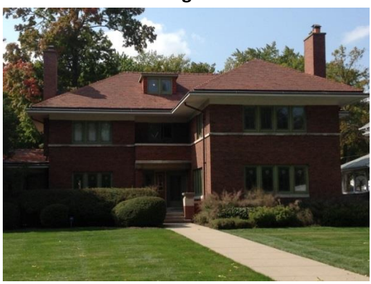
John W. Broughton House (1909)