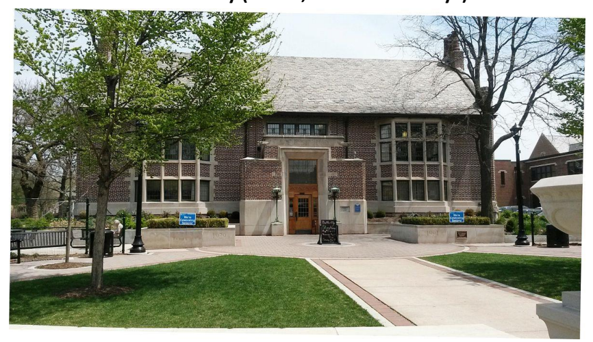
River Forest Library (1928)