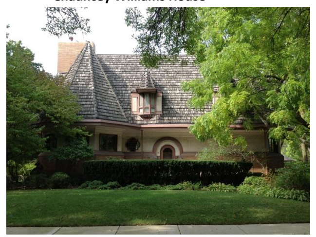
Chauncey Williams House (1895)