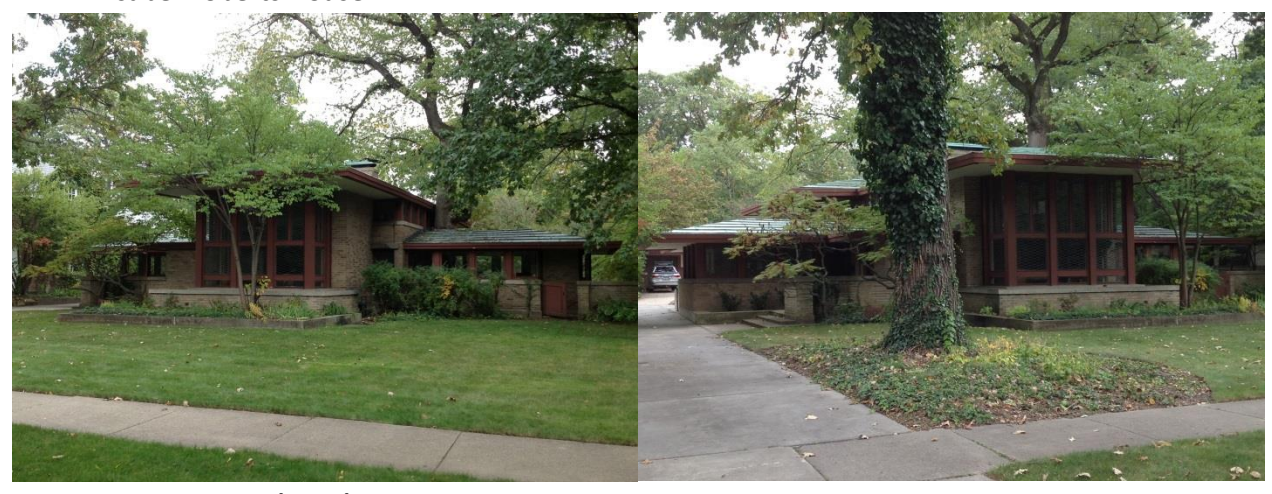
Isabel Roberts House (1908)