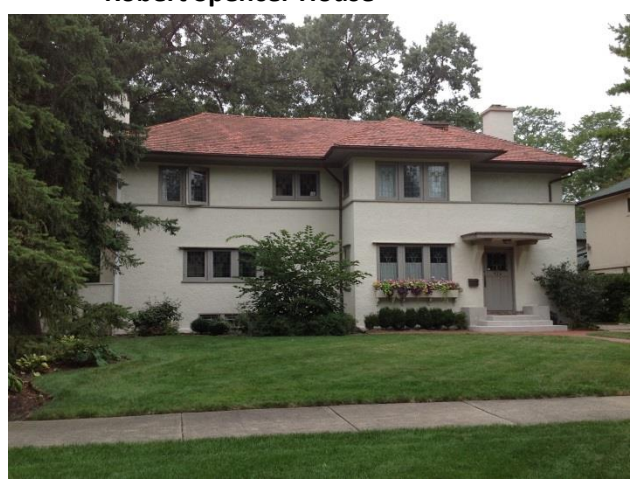
Robert C. Spencer House (1905)