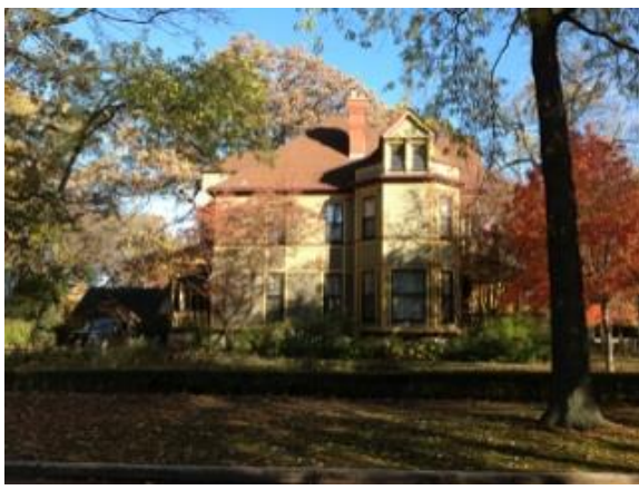
William Hatch House (1882)