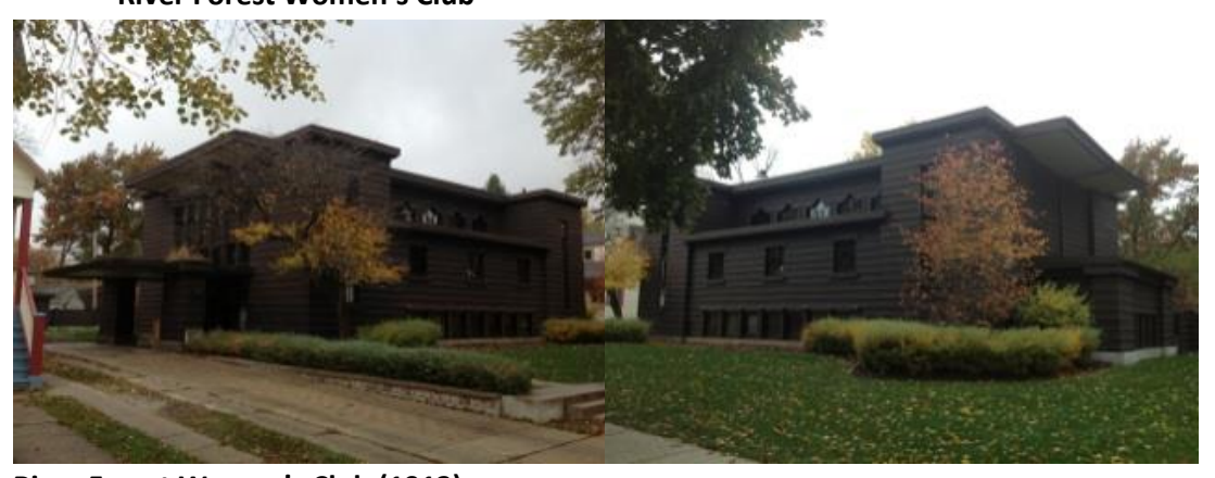
River Forest Women's Club (1913)