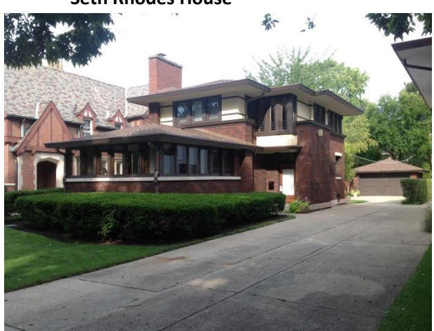
Seth Rhodes House (XXXX)