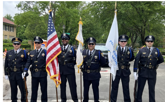
Honor Guard at the Memorial Day Parade