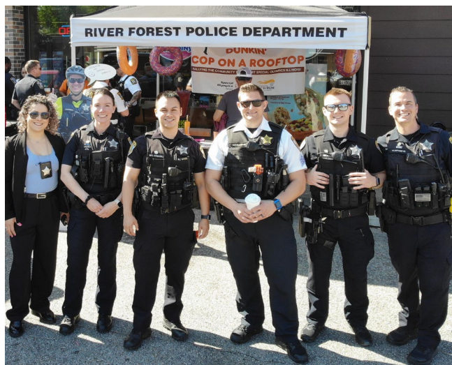
River Forest Police participated in Cop on a Rooftop in support of the Special Olympics of Illinois