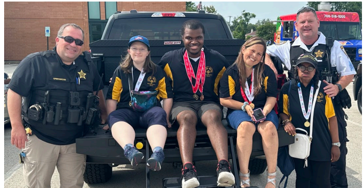
Special Olympics Law Enforcement Torch Run