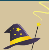
Willard Elementary School