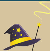
Willard Elementary School