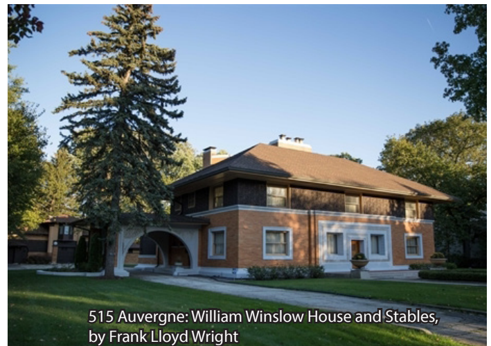
515 Auvergne: William Winslow House and Stables, by Frank Lloyd Wright

A list of the properties that would be subject to this change and more information can be found vrf.us/HPCOrdinanceChange . Owners of these properties are being contacted directly to notify them of this proposed change. All are welcome to attend this public meeting to learn more and or provide comments on this proposed change.