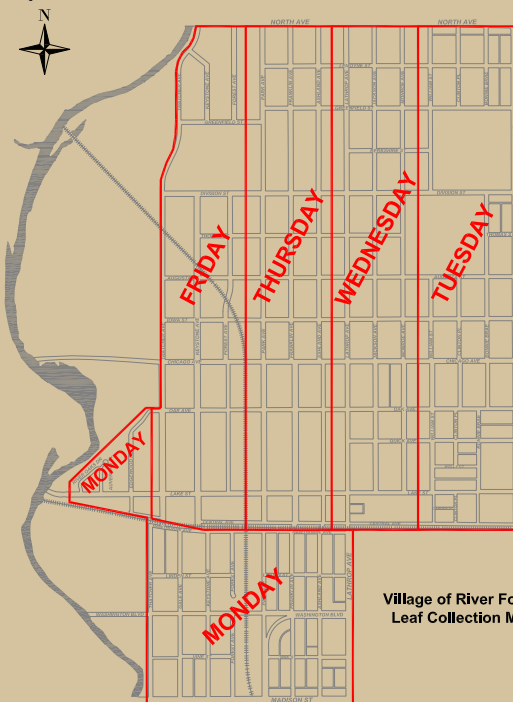
Village of River Forest Leaf Collection Map

Please note, this program allows for the pick-up of leaves only . Grass clippings, brush and any other type of material should be disposed of in accordance with the Village's refuse and yard waste procedures. Anyone interested in participating in the Village's Curbside Composting Program can find additional information at vrf.us/Compost .