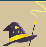
Willard Elementary School