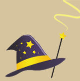
Willard Elementary School