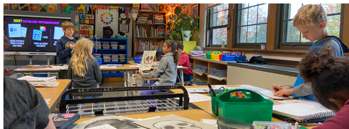
Fourth Graders at Willard Elementary created Dia de los Muertos skull drawings with chalk and colored pencils in art class with Ms. Parker.

Also this fall, two Exemplary Designations and a Commendable Designation were given to D90 schools, which were the top two of five designations given by the Illinois State Board of Education. Willard's index score indicates performance in the top 3-4% of all K-8 public schools in the state and marks the second year in a row that the school has earned the Exemplary Designation. The index score for Lincoln indicates performance in the top 1% of all K-8 public schools in Illinois. Learn more here .