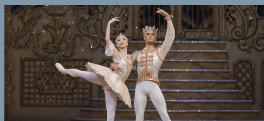
Royal Ballet Nutcracker

Get in the spirit of the season with a recorded virtual performance of Tchaikovsky’s The Nutcracker performed by the United Kingdom’s internationally renowned Royal Ballet. The ballet, a holiday staple for all ages, can be viewed Saturday, December 16, and Sunday, December 17. Registrants will receive an email with a special link to the performance.