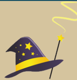
Willard Elementary School