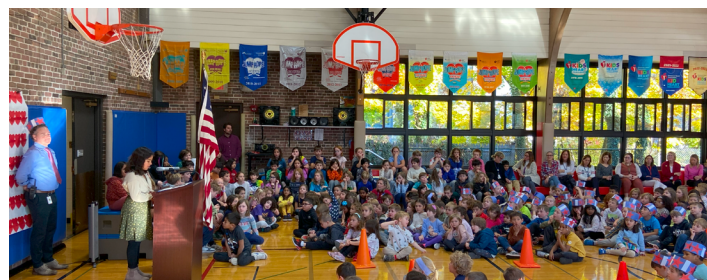
Lincoln Elementary students honored Veterans during the annual Veterans Day Assembly on November 13.