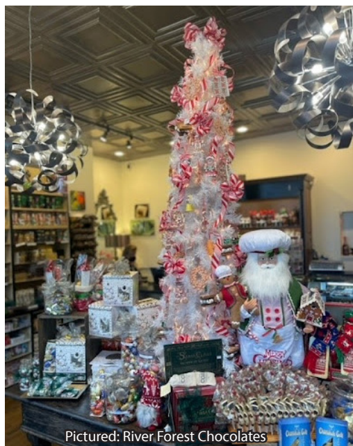
Pictured: River Forest Chocolates