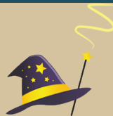
Willard Elementary School