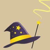
Willard Elementary School