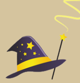
Willard Elementary School