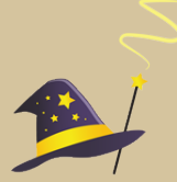
Willard Elementary School