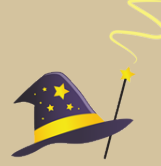
Willard Elementary School