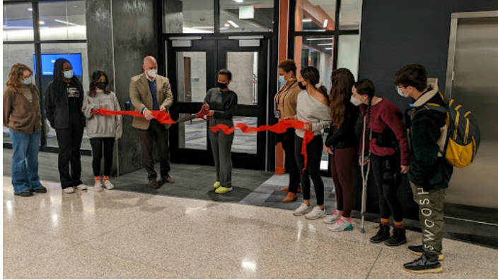
Student leaders celebrate the opening of the new OPRFHS Student Resource Center.

The public ribbon-cutting ceremony was canceled due to COVID-19. However, the school did hold a more intimate ribbon-cutting with students. To see a video highlighting the new Student Resource Center, visit bit.ly/SRCreveal .