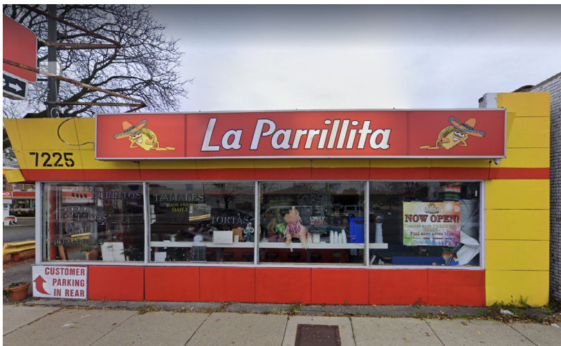
district90.org | 708-771-8282

In addition to online resources, FRED offers Zoom support meetings on the first Tuesday of the month from 7 - 8:30 p.m. and the third Tuesday of the month from 12 - 1:30 p.m. FRED is based in Oak Park and River Forest, and serves families throughout the Chicago region.