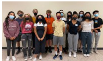
oprfs.org | 708-383-0700

Pictured: National Merit semifinalists, National Hispanic Scholars, and National African American Scholars who were able to attend the annual family breakfast to honor them on September 9.